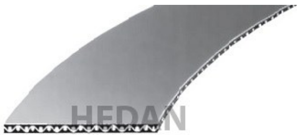
Typ 150: h = 1,0 \text{ mm}